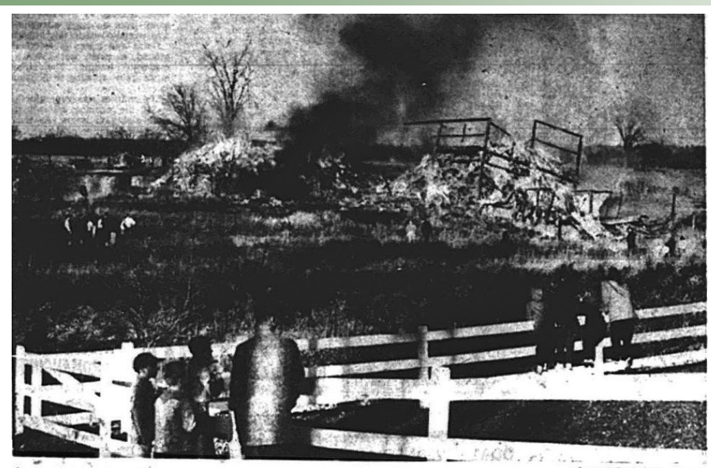
THE SAVAGE BARN in Cayuga Heights burns Monday afternoon. Two children face Children's Court action as a result. (Story on Page 3.)

Front-page photo from the Ithaca Journal, November 12, 1957