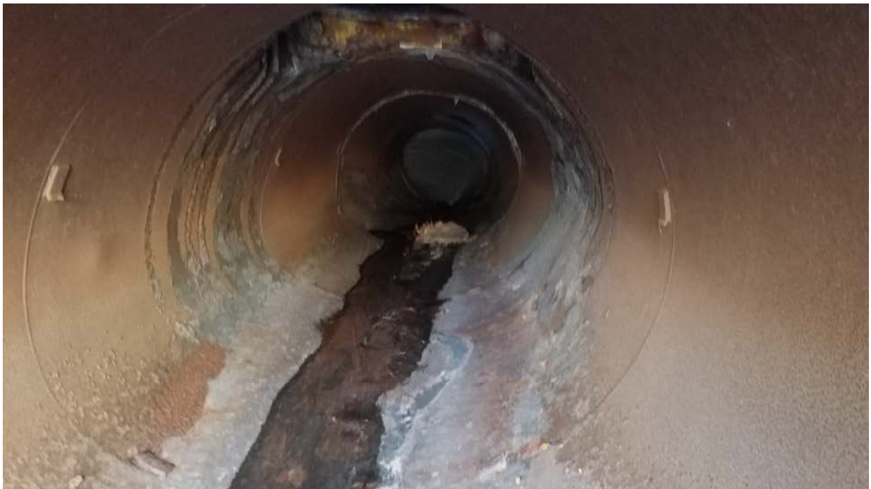
Photo #2 – Looking Downstream From Inlet of Structure – Pipe failure at top of pipe