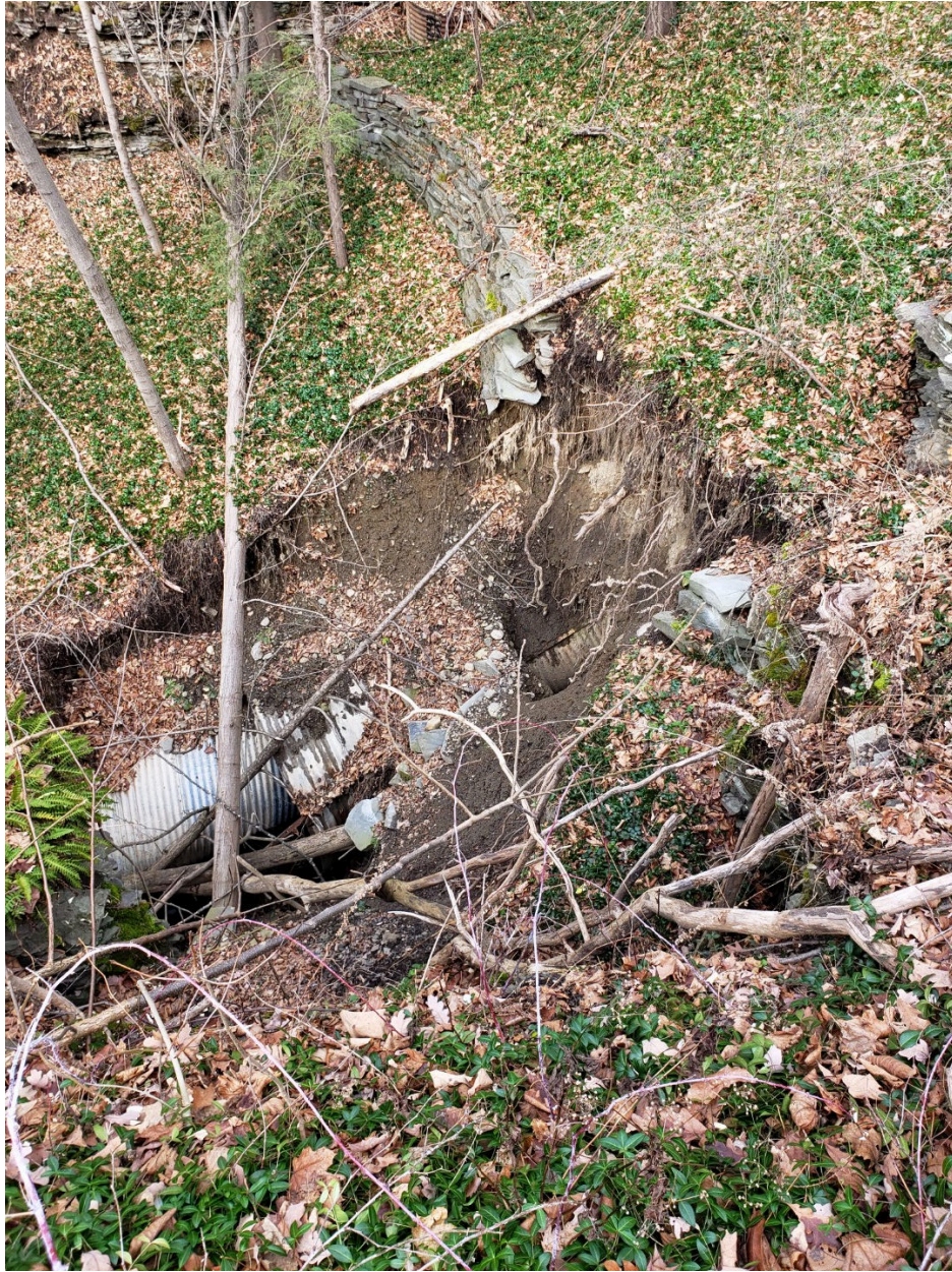
Photo #9 – Looking north at the outlet end of separation in Photo #4.