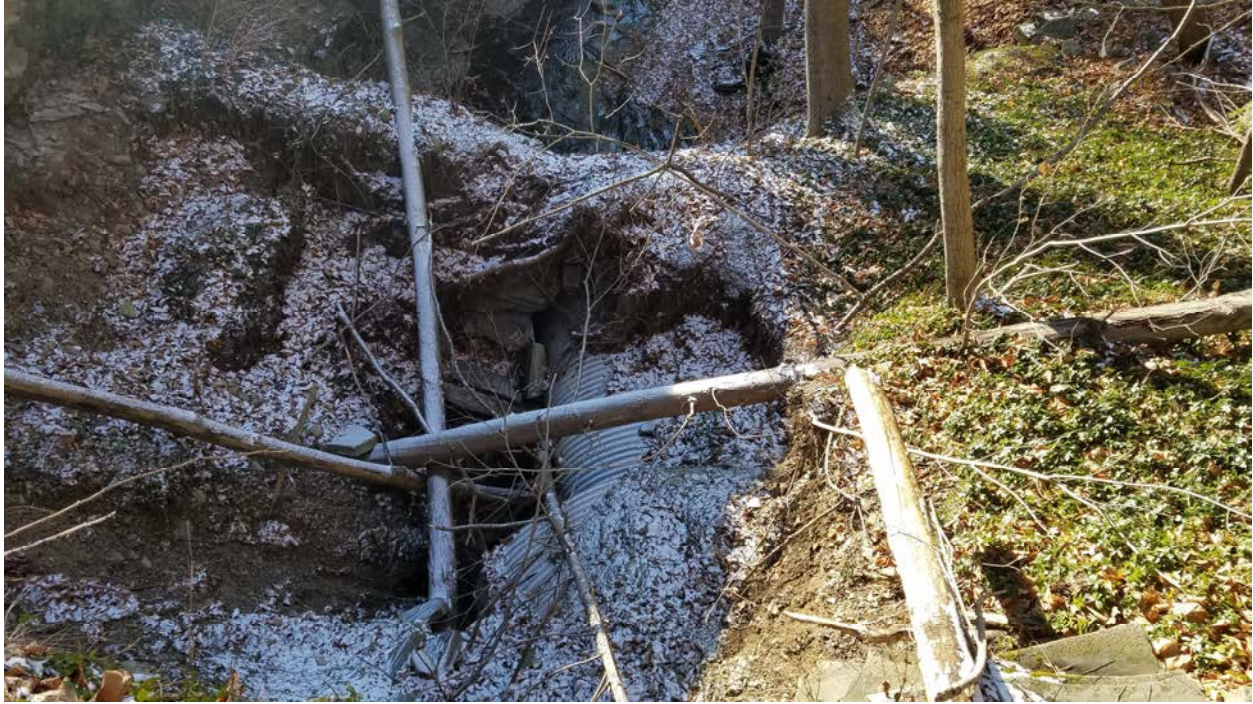
Photo #6 – Looking downstream from road of erosion at pipe separation in Photo #4