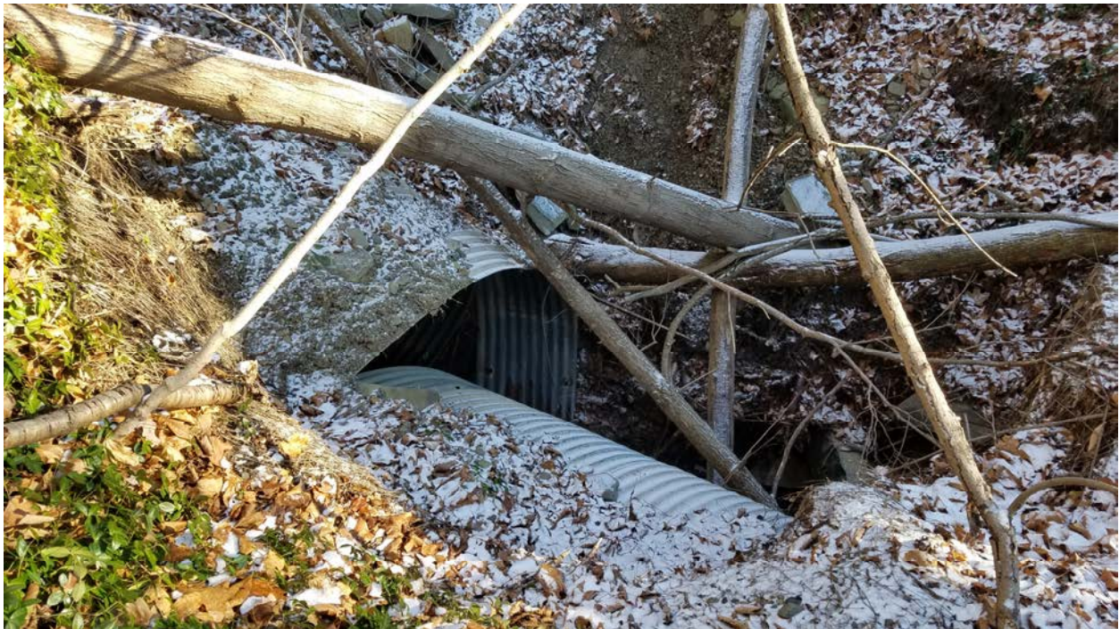
Photo #4 – Outlet End of Pipe – Separation of last length of pipe and second to last length of pipe